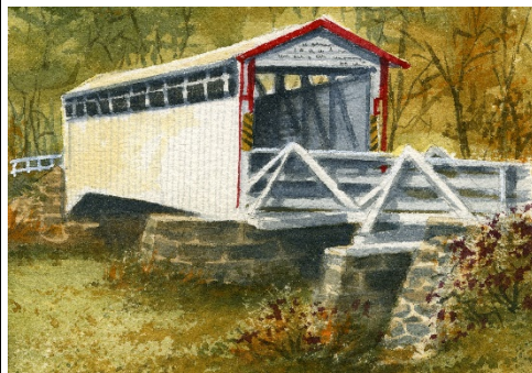
Jackson's Mill, Bedford County 5x7, 8x10, card