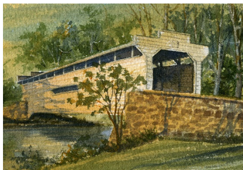
Kennedy, Chester County 5x7, 6x10, card