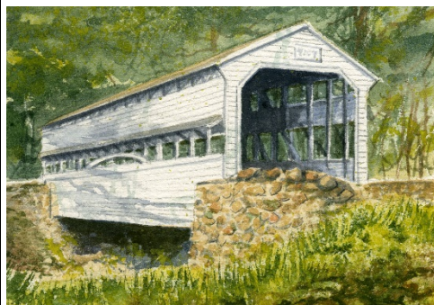
Knox, Chester County 5x7, 7x10, card