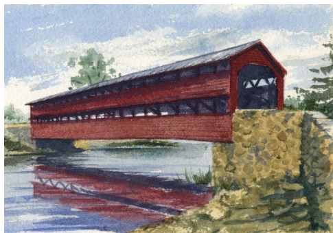
Sachs, Gettysburg, Adams County 5x7, 7x10, card