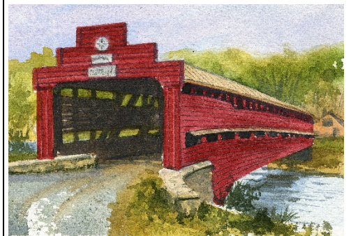
Dreibelbis Station, Berks County 5x7, 6x10, card